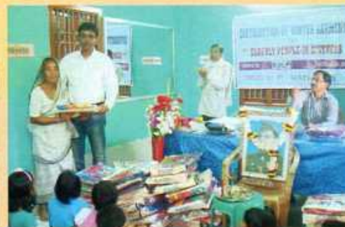
Distribution of Winter Garment to Aged by Kulpi Block Welfare Officer