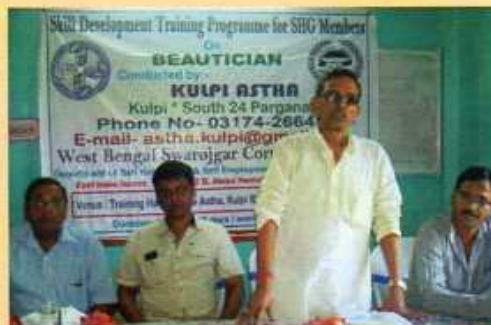
Local MLA, Block Social Welfare Officer & Manager UCO Bank amidst the trainees of Beautician Course