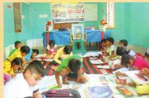
Sit & Draw Competition