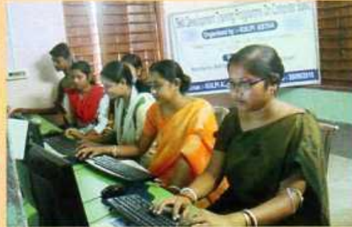
Trainees in Computer