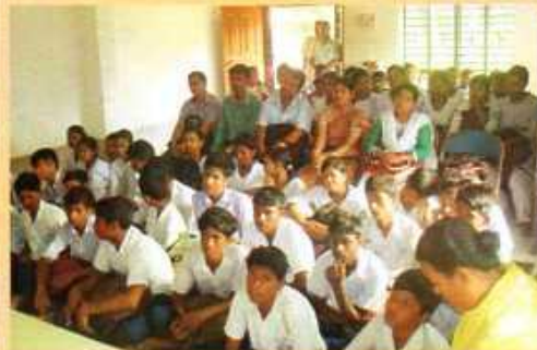
Participants in AGP-Safe Drive, Save Life