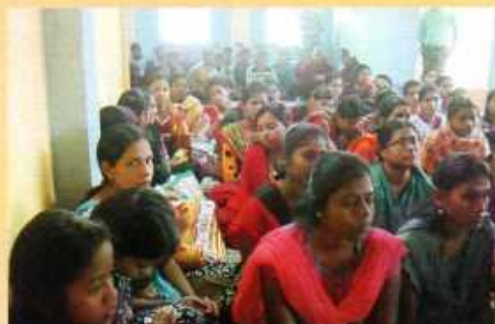
Participants in AGP on Early Marriage & Motherhood