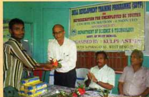
Distribution of Kits to trainees in Refrigeration