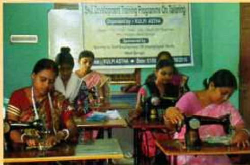
Trainees in Tailoring