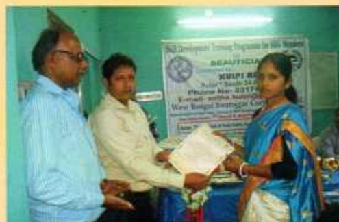
Joint B.D.O., Kulpi Block in Certificate Distribution