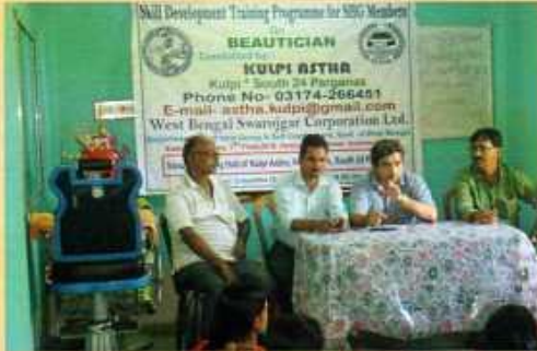
Inauguration of Beautician Training